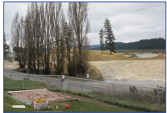
Valley School District is concerned about silica dust from Lane Mountain Company, located across the street.

Valley School District in Stevens County, Washington is located directly across the street from Lane Mountain Company, the largest producer of silica sand in the Northwest. The Washington State Department of Health and the Agency for Toxic Substances and Disease Registry (ATSDR) are working on an air sampling program (also known as an environmental exposure investigation or EI) in Valley, Washington. We are taking air samples at the school and a few nearby locations to learn if silica dust from Lane Mountain Company could impact the health of students and staff at Valley School District.