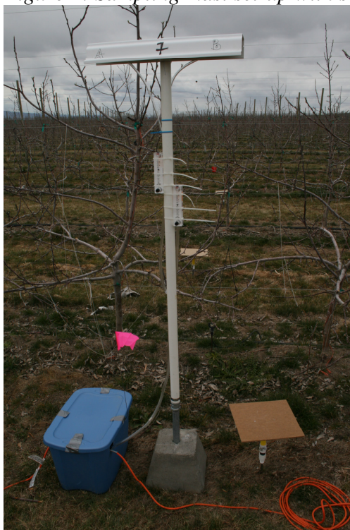
Figure 1: Sampling mast set-up with sampling train