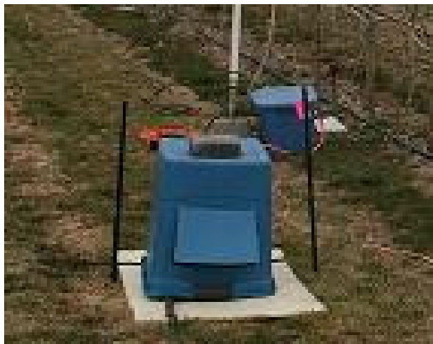
Figure 4: Perimeter Generator cover