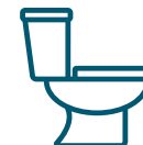
ASSISTING IN TOILETING OR CHANGING BRIEFS