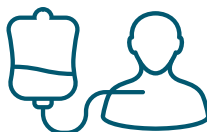
INDWELLING MEDICAL DEVICE CARE