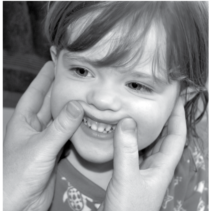
Lift my lip to check my teeth for pale or dark spots.

If your child has not had a first dental checkup, it's time. Call your child's dentist to make an appointment. For help finding dental care, call the Family Health Hotline at 1-800-322-2588 or go to parenthelp123.org/families/childrens-dental-health .